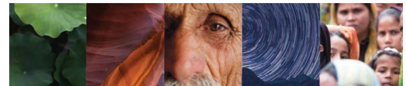
2017 LOTTIE MOON CHRISTMAS OFFERING®