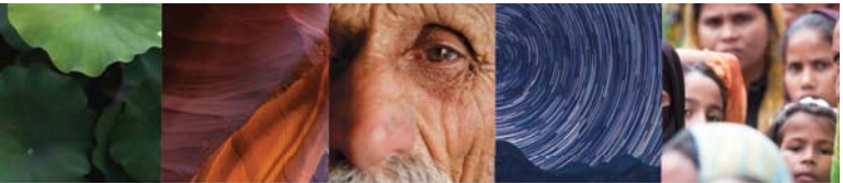
2017 LOTTIE MOON CHRISTMAS OFFERING*